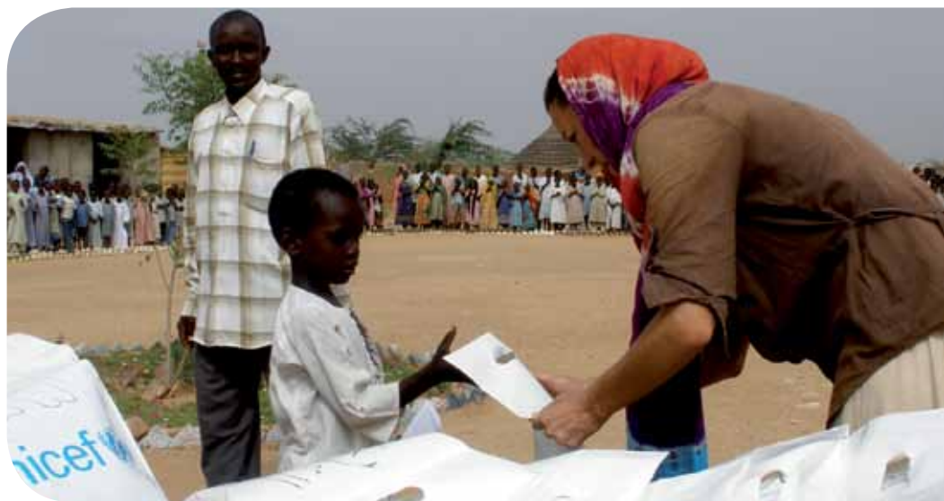
Louise presents a prize to a proud young refugee student in Gaga camp, Chad